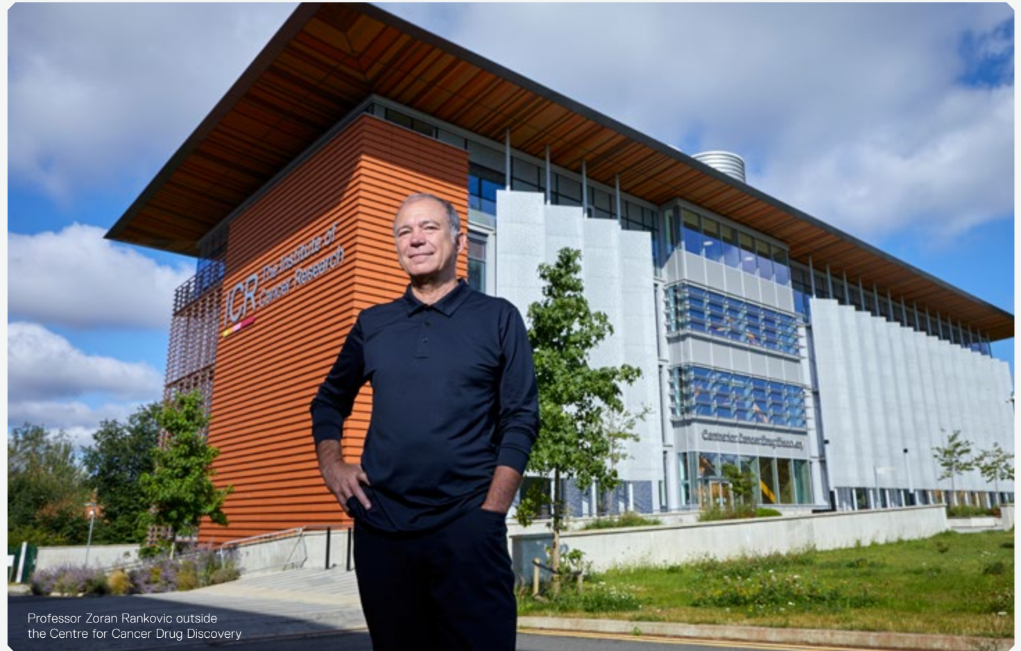
Professor Zoran Rankovic outside the Centre for Cancer Drug Discovery

Targeted protein degradation has emerged as a promising approach to address this challenge. Instead of merely blocking protein activity, this pioneering strategy hijacks the cell's natural waste disposal system to eliminate cancer-causing proteins. As a result, these new therapies