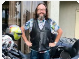
Hairy Biker, Dave Myers, with his beloved motorbike

More than 45,000 motorcyclists travelled in convoy from London to Dave’s hometown of Barrow-in-Furness. The ride, which was organised by volunteers and led by fellow Hairy Biker